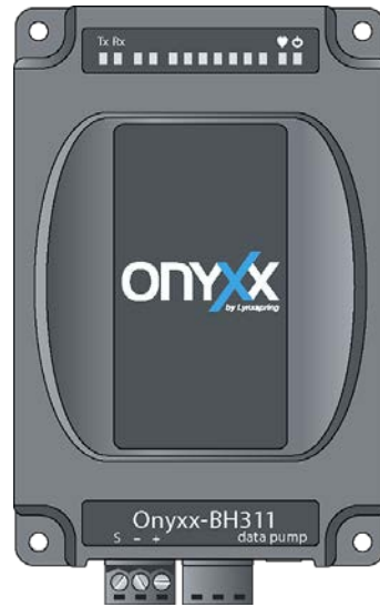
Onyxx BACnet to Haystack Data Pump